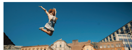
Junior Cert: German