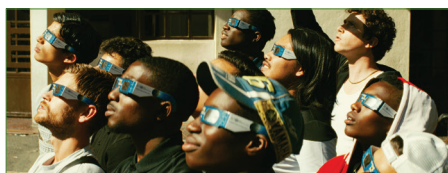
Junior Cert: French