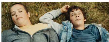
Leaving Cert: German

Please see corkfilmfest.org for more details or contact schools@corkfilmfest.org to enquire and to book.