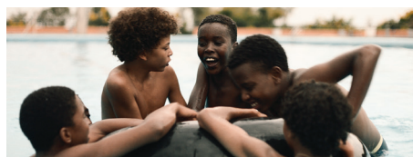
Leaving Cert: French