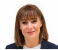
Josepha Madigan T.D.

Josepha Madigan T.D. Minister for Culture, Heritage and the Gaeltacht Time 12.50pm - 1.15pm Location Iontas Building Lecture Theatre