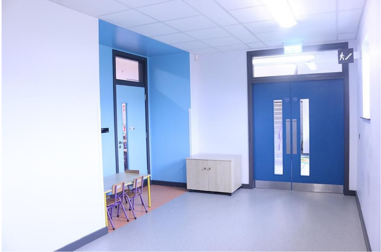
Upstairs to 5 th , 6 th classes and After-school rooms.