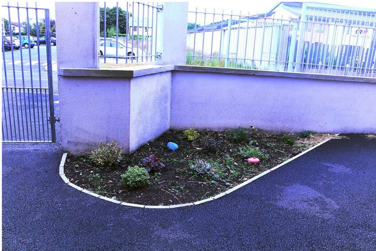
Soft surface area outside Junior and Senior Infants