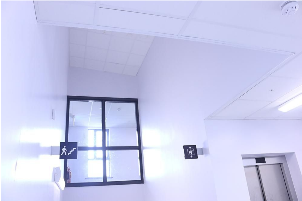
Downstairs to Junior and Senior Infants