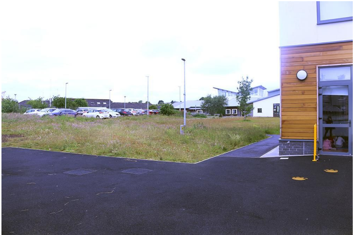
The older school building