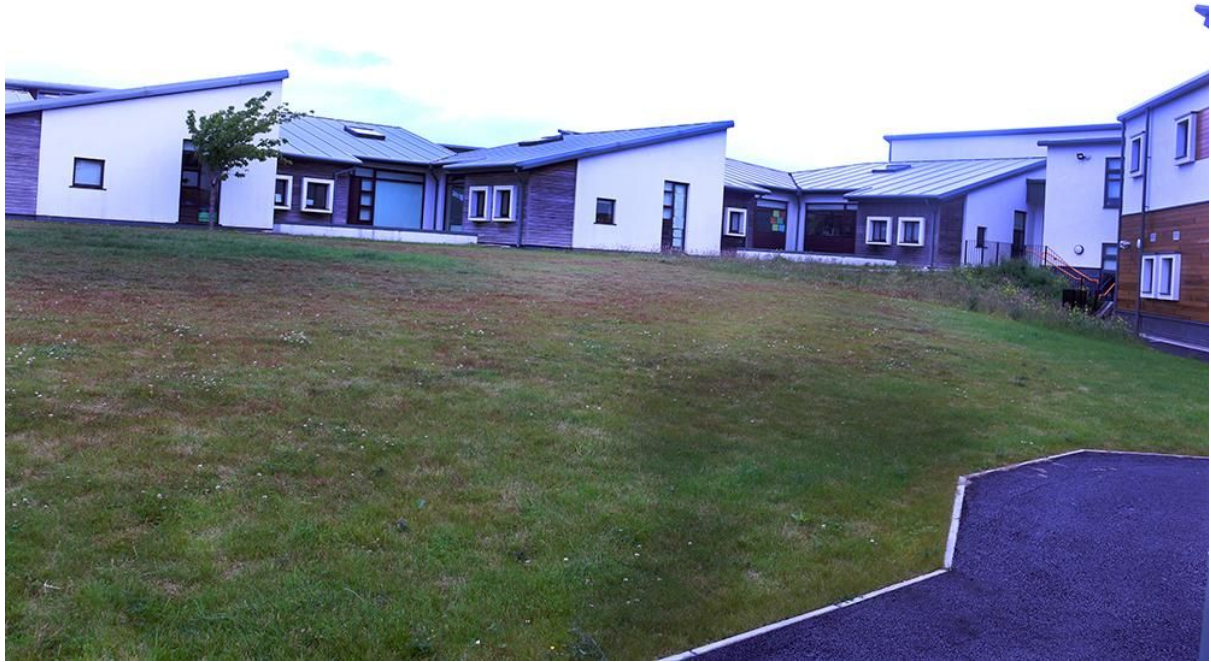
Original school garden area