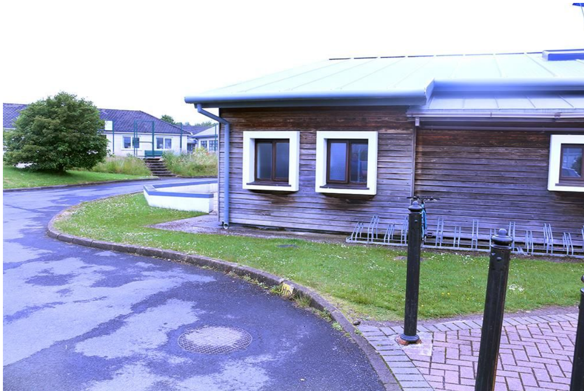
Wild flowers growing between the old school building and playground