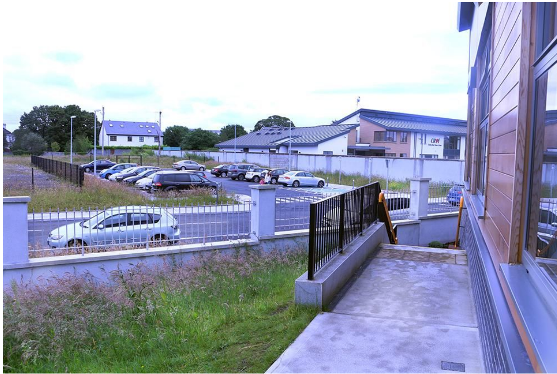
View of car park opposite the school entrance at the new building